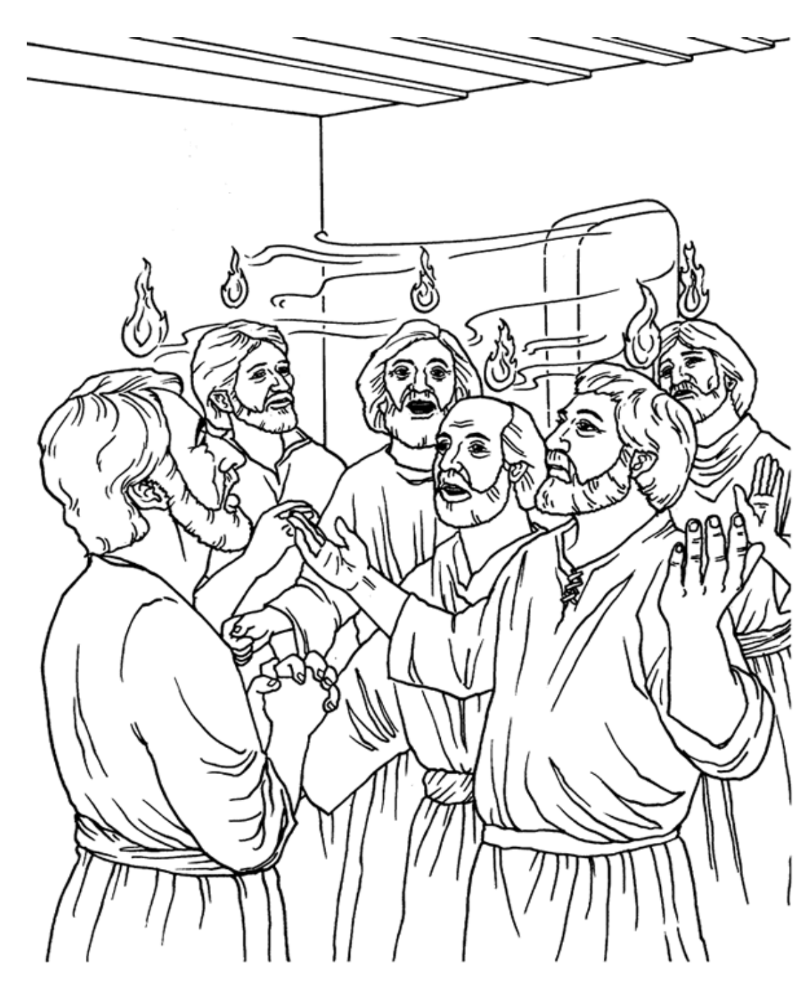
The Day of Pentecost Acts 2

From BibleStoryCard Learning System™ Coloring Book © 1996 Wesleyan Publishing House Used by permission. Additional BibleStoryCard resources available by calling 1-800-493-7539 or visiting online <a href="http://www.parable.com/wph/group">http://www.parable.com/wph/group</a> 1052.htm