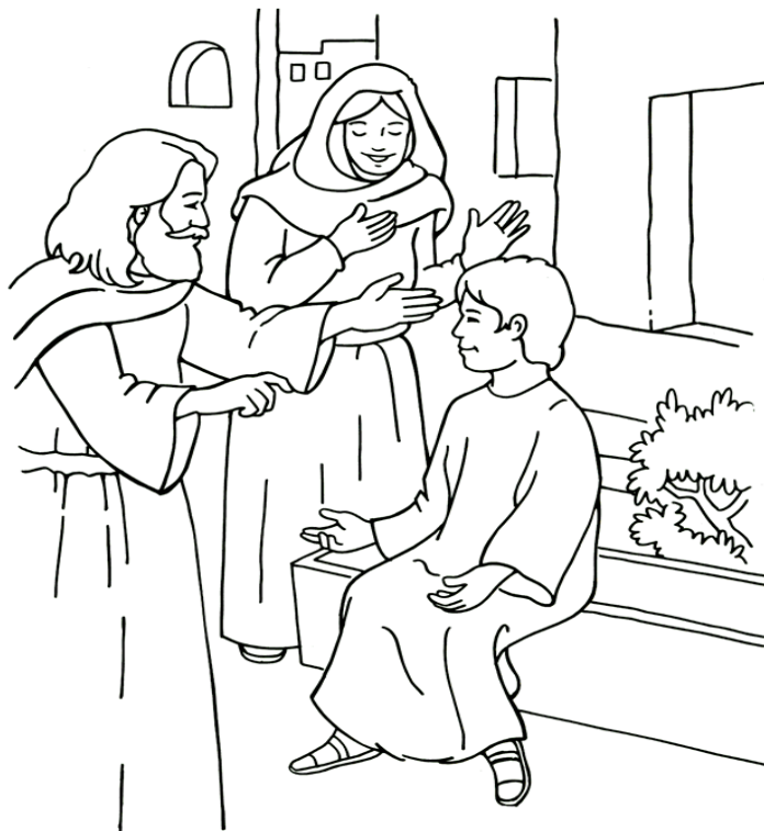
Jesus Raises a Young Man to Life

From Thru-the-Bible Coloring Pages for Ages 4-8. © 1996, 1998 Standard Publishing. Used by permission. Reproducible Coloring Books may be purchased from Standard Publishing, www.standardpub.com , 1-800-543-1301.