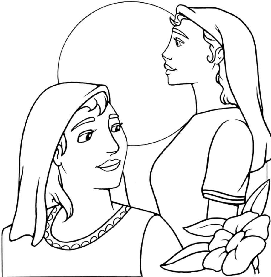
Leah and Rachel

Now Laban had two daughters; the name of the older was Leah, and the name of the younger was Rachel.