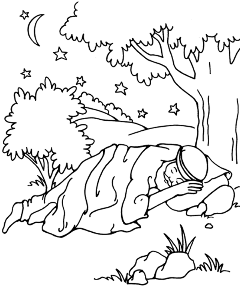
God Cares for Jacob

From Thru-the-Bible Coloring Pages for Ages 4-8. © 1986, 1988 Standard Publishing. Used by permission. Reproducible Coloring Books may be purchased from Standard Publishing, www.standardpub.com , 1-800-543-1301.