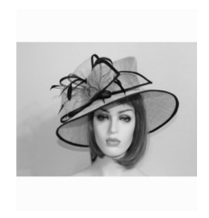
Happy Mother's Day!

May 14<sup>th</sup> is Mother's Day. What a great day to wear a hat to Church in honor of your mother.