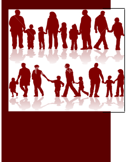
News about our Faith Family